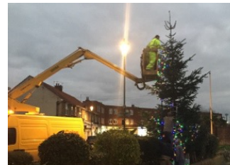
Putting up the new lights

The tree was thanks to Butlins. The new lights were bought with a grant from Felpham Parish Council. The hanging of the lights was kindly done by JAM Electrical from Bognor Regis.