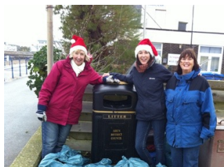
Christmas spirit at the Felpham Beach Clean

Our thanks go to the hardy volunteers who have braved all weathers in order to participate in the Monthly Beach Clean. A whopping 85 bags of rubbish and 12 of recycling was collected in 2015, along with a variety of discarded ropes, netting, pots and even some roofing material blown off in the recent high winds! Locals young and old, and a few willing dogs, joined in with fine community spirit every month to help maintain our beautiful beaches and beach front greens, which we