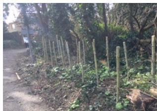
Creating the new dead hedge with ash stakes from Worms Wood

Visitors to the Gardens will already notice the ash stakes along the track side to the Woods forming the beginnings of a natural 'dead hedge'. This will surround the woods and give it definition and protection. To compliment this new hedge, the existing high live hedge at the entrance from Vicarage Lane will be cut down to waist height allowing light and sight lines into the wood.