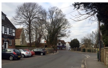
Speeding means danger to pedestrians round these blind corners

It's great to have the new road open and it would seem this is reducing traffic flow through the Village. However, the Society was disappointed to see the cancellation of the long awaited road mitigation projects. We very much hope that the main elements will be reinstated at some stage. Clearly, snarling up the traffic in the days leading up to Christmas was never going to work. At the same time the diverting of traffic round Vicarage Lane was ill conceived.